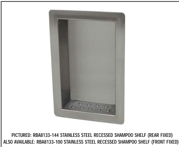
PICTURED: RBA8133-144 STAINLESS STEEL RECESSED SHAMPOO SHELF (REAR FIXED) ALSO AVAILABLE: RBA8133-100 STAINLESS STEEL RECESSED SHAMPOO SHELF (FRONT FIXED)