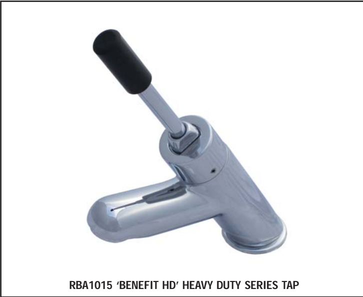
RBA1015 'BENEFIT HD' HEAVY DUTY SERIES TAP